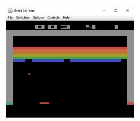
Figure 1: The Atari 2600 game Breakout

Q-learning is a reinforcement learning technique that uses positive and negative reward associated with some actions [3]. An agent will hope to maximize its long-term reward by using localized feedback based on the state of the game. Q-learning also employs a randomness percentage that starts at 100%, and is reduced every few episodes until it is zero. Randomness usually helps the agent find states that give high reward that it may not have seen by acting rationally. This algorithm was then paired with Breakout , a game where the player controls a paddle and tries to bounce a ball into rows of bricks to earn points, shown in Figure 1.