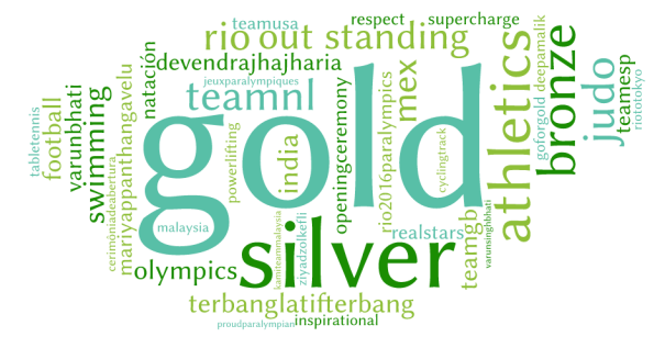
Figure 6: Paralympic Hashtags Word Cloud

The word cloud below effectively highlights most discussed topics on Paralympics 2016. In the word cloud, font size of hashtag is determined by frequency of its usage.