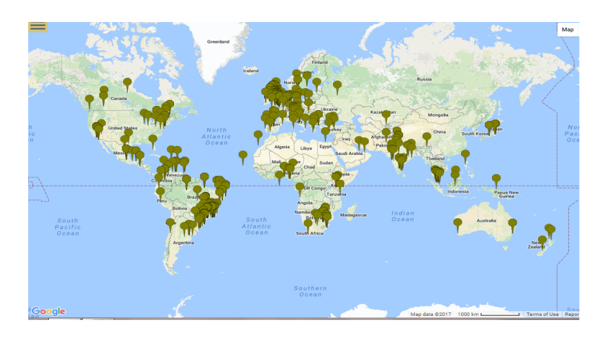
Figure 7: Map indicating tweet originated place

To perform this analysis, we parsed the tweets to extract geocode from where the tweet is originated. Then, we used Maps to visualize the data with Geocodes and Each dot on the map refers to the tweet originated location.