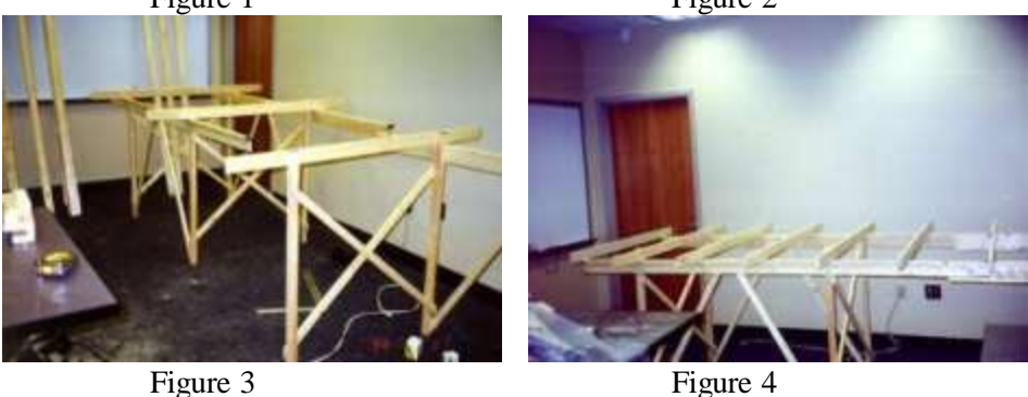
The top was constructed using the cookie-cutter technique in which a solid top is positioned, then sliced on both sides of all roadbed that needs to be elevated or depressed. The top consists of two layers: