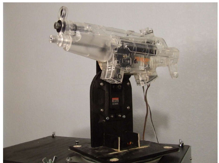
Figure 4: The AirSoft gun modified to run off the PC power supply and the trigger controlled from the BrainStem.