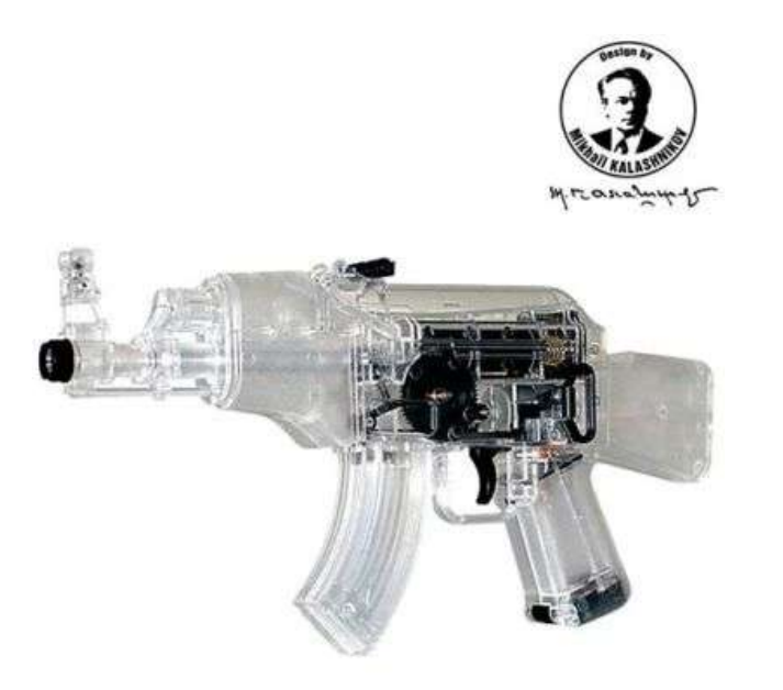
Figure 1: Kalashnikov AK-47 Airsoft Gun

The issue of portability has been addressed by upgrading the weapon subsystem. Rather than using a blowgun powered by a large air compressor, we have integrated a $24.98 <u>Kalashnikov AK-47 Airsoft Gun</u>, which uses an electro mechanical propulsion system that runs off of 6 volts and has a muzzle velocity of 130 fps, and is auto-loading and contains a magazine of 88 plastics BBs. The gun was purchased from the local K-Mart [2] (see Figure 1). This device, off the shelf, is normally powered by four batteries, but we reengineered it to run off of the same scavenged power supply that is used by our microcontroller. This has eliminated the need for the bulky air compressor, makes loading much simpler, and opens the opportunity for multiple shoots per trial. The new system is now very portable and our department will be easily able to take this system on the road to help recruit middle and high school students into our college of engineering.