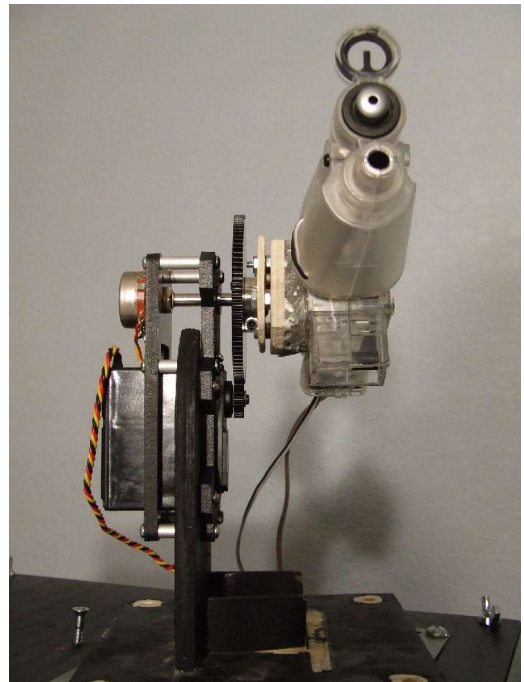
Figure 5: The AirSoft gun attached to a 5:1 reduction gearbox. The gearbox is connected to the Y actuator, which controls the elevation of the gun. The Y actuator is commanded by the BrainStem. At the bottom of the picture is the X actuator and gearbox that controls the left-right movement.