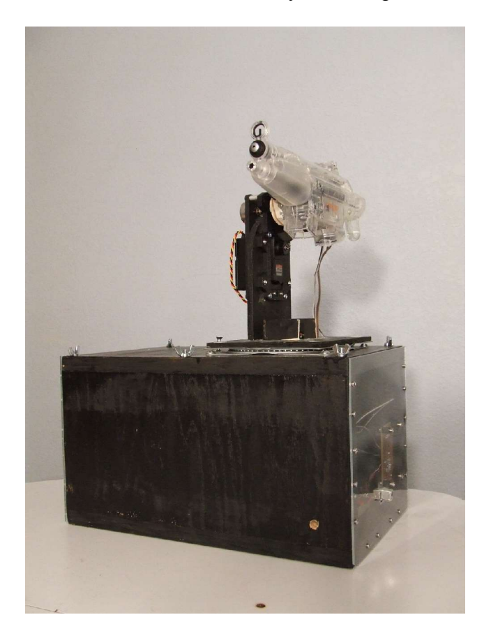
Figure 3: The entire turret assembly. The black box contains a salvaged PC power supply that powers the Airsoft gun on top, the X and Y actuators, and the BrainStem microcontroller. The BrainStem is also inside the black box.

By using an Air Soft gun as the primary armament, the Target Discrimination and Neutralization system gains a higher degree of portability and decreased setup time. This is because the Air Soft gun can be powered and triggered by the same hardware used to control its orientation. An air compressor was a large burden to move, set up, and could cause issues with respect to whether rooms could accommodate a demonstration. By having an armament that can remain permanently integrated, inputs and all, with the system hardware unit, we have reduced the system footprint dramatically.