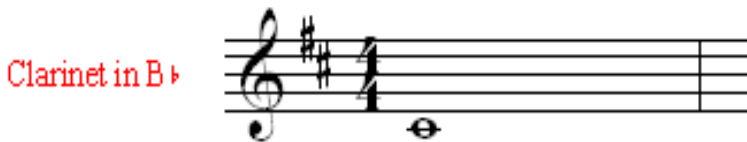
Figure 1: Middle C

The MusicXML version of that is listed below in Figure 2. This was created by exporting the file using the Dolet plug-in. Persons not familiar with XML will quickly notice the large file size typical of XML files. This is not a big of problem today as it would have been several years ago. If file size is a problem for sending a file over the internet, then compression methods can be used. Compressed MusicXML files are roughly the same size as Standard MIDI files for the same music, and contain much more notation information.