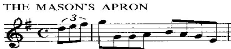
Figure 4: Mason's Apron as Converted to Music