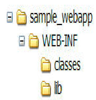
Figure 1. Web application layout

The notion of a web application is, of course, of fundamental importance. A web application's structure is mandated by the Java Servlet Specification and is perhaps best explained by the use of the following example: