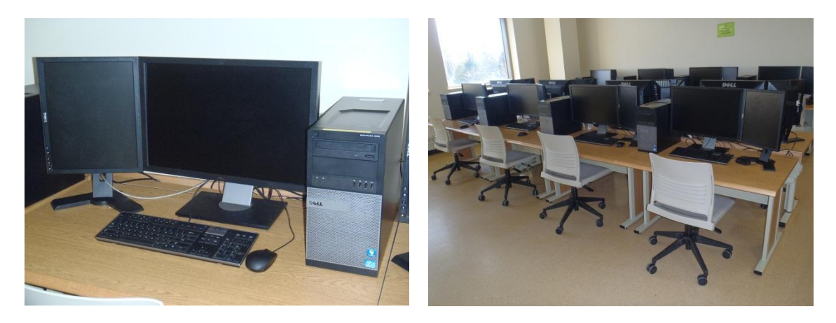
Figure 2: Workstation configuration and a portion of the computer laboratory layout