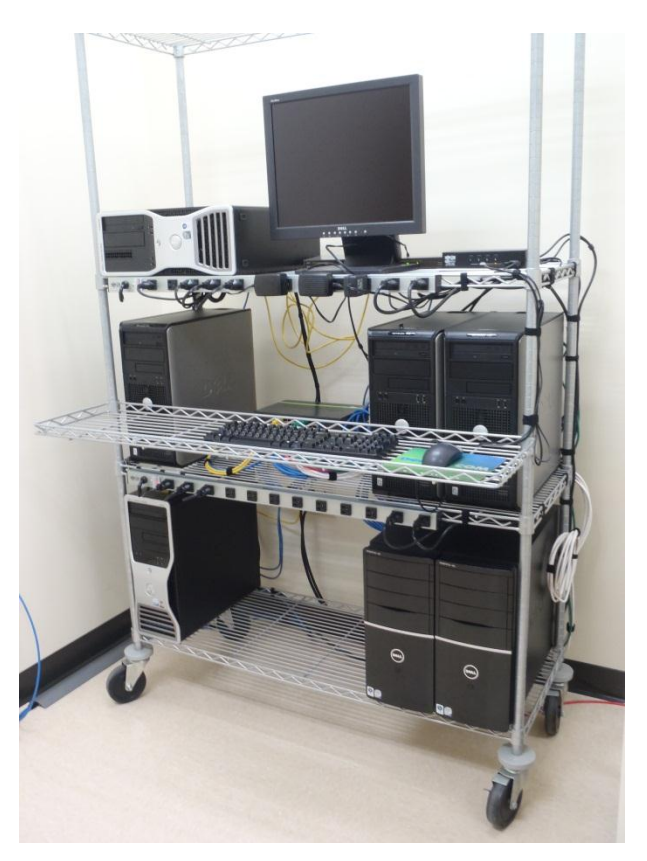
Figure 4: Portion of the sandbox with a mockup of the production system

The "sandbox" is a new addition to the computing infrastructure and consists of a pool of twelve personal computers, two workstations, network adaptors, hard disks, and various components suitable for experimentation and prototyping. The system is located in the server room along with the production system, but is isolated on its own private network. The sandbox allows students and faculty a place in which to explore and learn new concepts without disrupting the production environment. In addition, the sandbox also serves a mockup of the production system to test configuration changes before going live as shown in Figure 4.